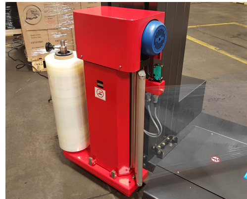
Film Carriage Assembly